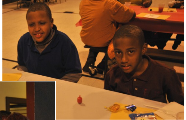
Right: Youngsters in Glenville learned about Chanukah, dreidels and gelt.

Our next dinners at St. Al's will be January 24 and February 28. Please join us in fulfilling the mitzvah in Deuteronomy 15:11, "you shall open your hand wide to your brother, to your poor, and to your needy."