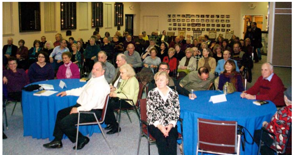
A filled sanctuary and an attentive audience.

We are already planning for next year's Speaker Series to take place on October 18, 2012, so be sure to mark the date on your calendar and check our temple website for more information. Also, please consider joining the Development Committee to work on the Speaker Series or one of our other temple fundraisers, such as the Reverse Raffle or the Golf Outing. Your help would be greatly appreciated and welcomed.