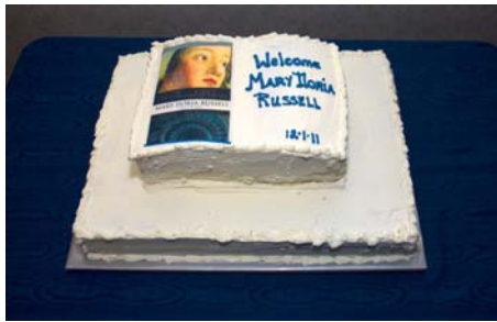
"Book" cake by Susie Strom